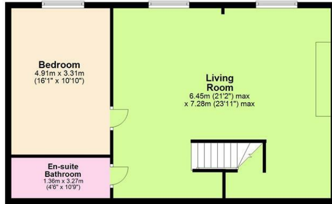
Basement Floor Approx. 68.1 sq. metres (733.3 sq. feet)